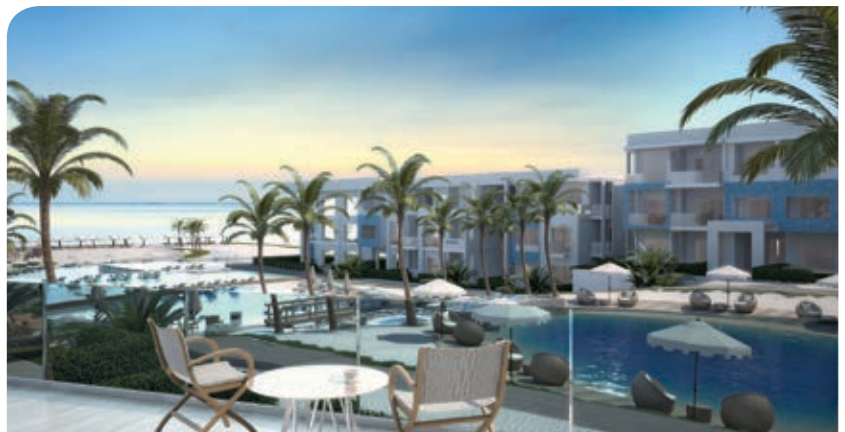
The House Hotel & Residence Fouka Bay

Our hotels have a standout feature, too: We look at the ground floor in a very different way where we don't necessarily need to