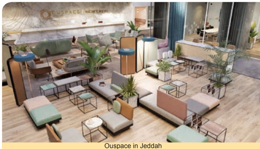
Ouspace in Jeddah

We create experiences and this what appeals to Generation Z who are purported to be the largest travel group that rents smaller