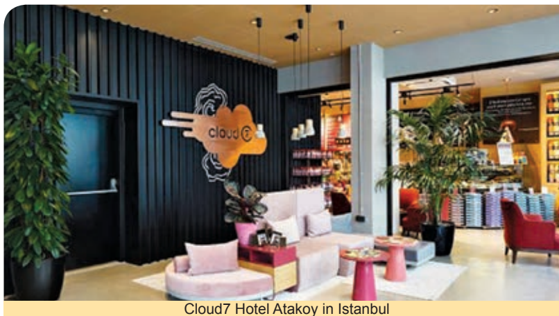
Cloud7 Hotel Atakoy in Istanbul

When I was younger, we lived in a touristic area and my friends' parents owned hotels and restaurants and I felt a great affection and affiliation to the industry. My journey in the hospitality field started with Hilton where I held senior operational and commercial management positions for over a decade. After studying and pursuing a corporate career in hospitality, I believe, there has been a